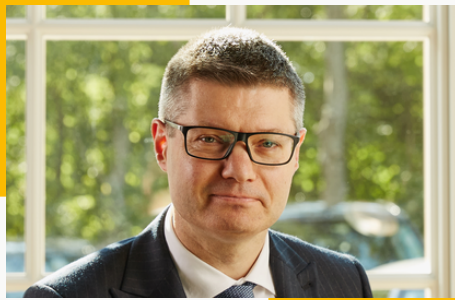
Lord Simon Wolfson, Next